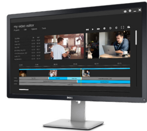
Dell UltraSharp Ultra HD 4K Monitor with PremierColor | UP3216Q