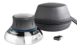
3DCONNEXION SPACEMOUSE WIRELESS

Enjoy a revolutionary 49-inch dual QHD curved monitor with ultra wide views, multitasking features and seamless USB-C connectivity for an immersive work experience.