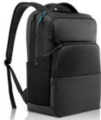
DELL PRO BACKPACK 17 | PO1720P

Connect your Precision to almost any device with a convenient 6-in-1 compact adapter, to collaborate from any location.