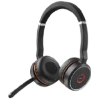
JABRA EVOLVE 75

Protect your notebook and accessories with this lightweight backpack that is made with shock-absorbing EVA foam.