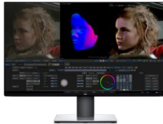
DELL ULTRASHARP 32 4K USB-C MONITOR WITH PREMIER COLOR | U3219Q

Dell's most powerful dock* for our most powerful workstations* delivers the ultimate productivity experience. Charge your system faster, support up to three 4K displays and connect to your peripherals via a single cable with dual USB-C connectors for up to 240W of power delivery.