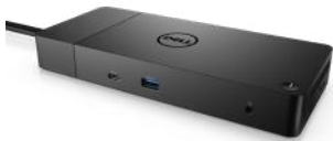
DELL PERFORMANCE DOCK | WD19DC

Dell's most powerful dock* for our most powerful workstations* delivers the ultimate productivity experience. Charge your system faster, support up to three 4K displays and connect to your peripherals via a single cable with dual USB-C connectors for up to 240W of power delivery.