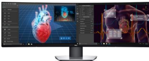
DELL ULTRASHARP 49 CURVED MONITOR | U4919DW

Enjoy a revolutionary 49-inch dual QHD curved monitor with ultra wide views, multitasking features and seamless USB-C connectivity for an immersive work experience.